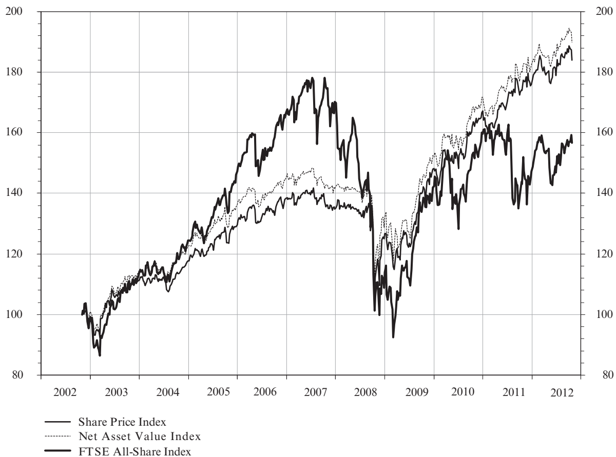
Performance Relative to FTSE All-Share Index